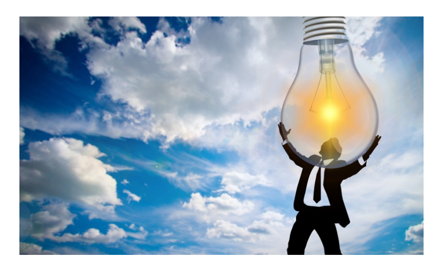
WATER TEST NETWORK LAUNCHED OFFICIALLY!