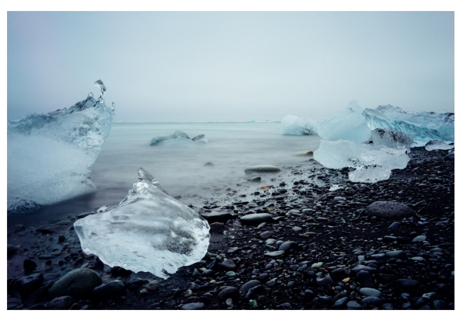
PROTECTING AND RESTORING EUROPE'S WATERS: AN ANALYSIS OF THE FUTURE DEVELOPMENT NEEDS OF THE WATER FRAMEWORK DIRECTIVE (WFD)

100 water experts took part in a questionnaire in relation to updating the Water Framework Directive (WFD). This article provides recommendations to improve the WFD Directive with regard to monitoring and assessment systems, improving programmes of measures and further integration with other sectoral policies. The analysis highlights that there is great potential to enhance assessment schemes through strategic design of monitoring networks and innovation, such as earth observation. New diagnostic tools that use existing WFD monitoring data, but incorporate novel statistical and trait-based approaches could be used more widely to diagnose the cause of deterioration under conditions of multiple pressures and deliver a hierarchy of solutions for more evidence-driven decisions in river basin management.